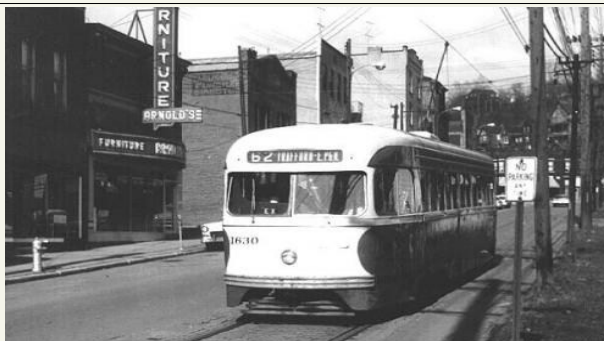
Pittsburgh Railways Trolley in downtown Pitcairn 1961